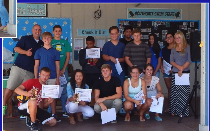
15 -18 Girls and Boys