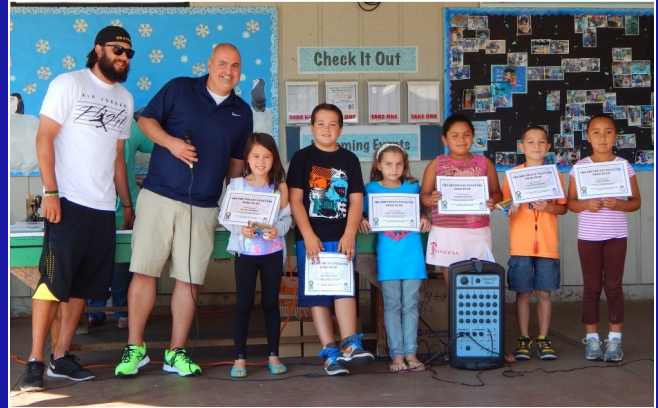
7-8 Girls and Boys