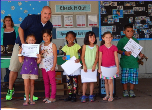
6 and Under Girls and Boys