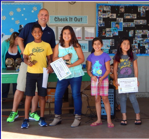
9 -10 Girls and Boys