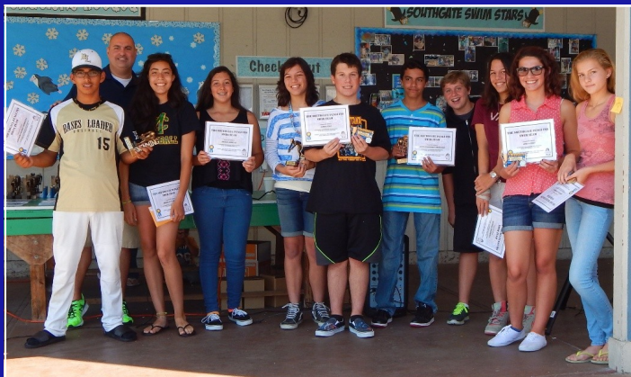
13 -14 Girls and Boys