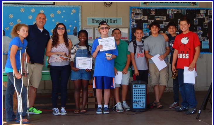
11-12 Girls and Boys